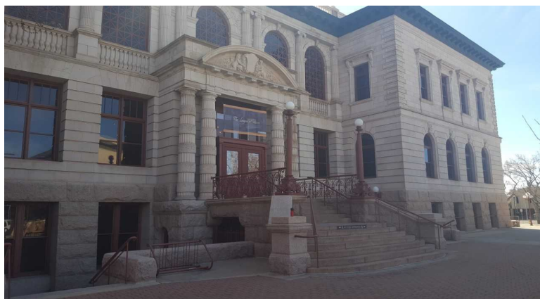
The League of Wives sign outside the Colorado Springs Pioneers Museum on opening day