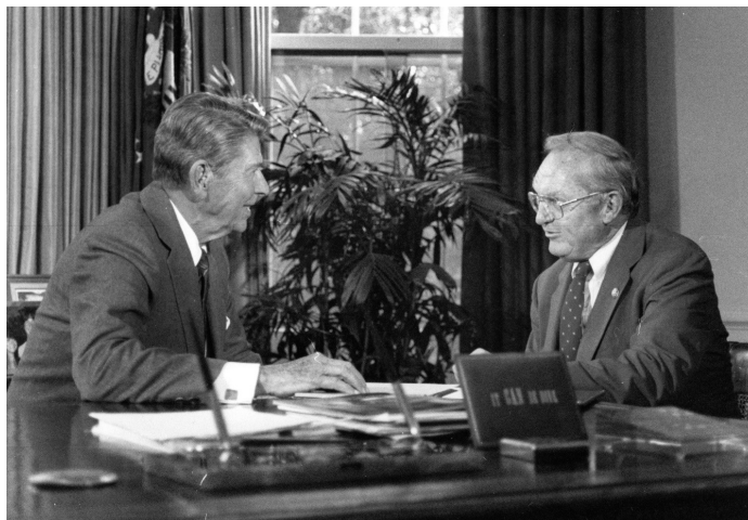
Howard Coble (R) and Ronald Reagan (L).