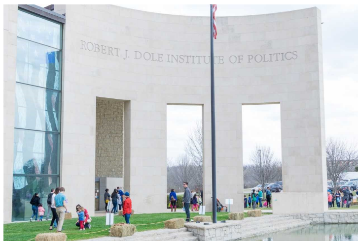
Families participating in the Easter Egg Roll with Dole

The third annual Easter Egg Roll with Dole on March 31, 2018, was another great success! An estimated 750 attendees – 350 of them being young students – had a grand time engaging in egg hunts, egg rolls, crafts, storytime, games, and playing with live bunnies. The event also included a “Golden Rules” checklist to encourage learning civic actions as attendees visited all of the activities. Join us next year on April 20 for this entertaining tradition styled after the White House Egg Roll!