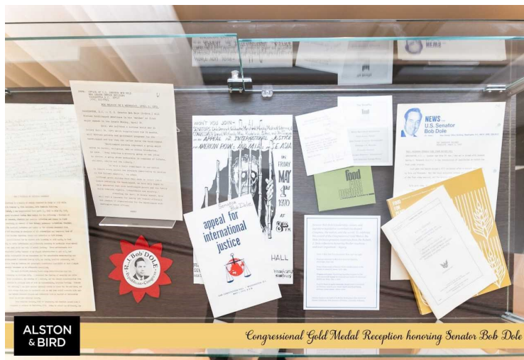
One exhibit case at the Alston & Bird reception following Dole’s Congressional Gold Medal ceremony

Senator Bob Dole received the Congressional Gold Medal, the highest civilian honor bestowed by the U.S. Congress, in a ceremony in the Capitol Rotunda on January 17, 2018. In honor of the Senator’s award, the Dole Archives produced a small exhibit featuring his archival documents that highlighted career milestones and provided photos and video, which Alston & Bird displayed following the ceremony at a reception in his honor. The display, with a reproduction of the Congressional Gold Medal, is now on exhibit at the Dole Institute of Politics.