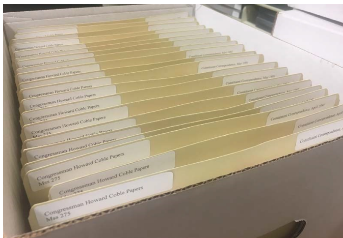
A processed box of constituent correspondence.

ships, privacy concerns, and accessibility of the collection. This process was influenced by the archivists' engagement with a variety of different communities – including Howard Coble's family members, community members who felt a strong personal or political attachment to Coble, and community businesses or organizations who also felt a strong connection to Coble. Each of these groups had different interests and desires from the collection.