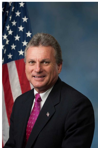
Congressman Buddy Carter

cent congressional career representing coastal Georgia's 1st District. Carter was elected to the U.S. House of Representatives in 2014, and he serves on the Committee on Energy and Commerce.