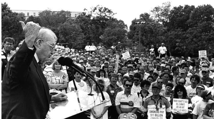
Howard Coble speaking at a rally on tobacco tax.

2015, contain materials that document the political landscape of the Piedmont region. Having such a long span of records from one political representative gives researchers the opportunity to see change over time. Archivists from UNCG worked with the Congressman, his staff, and family to transfer records to the archive both during and after Coble's passing in 2015. Balancing donor relations, privacy, and confidentiality concerns was an integral part of providing access to this collection.