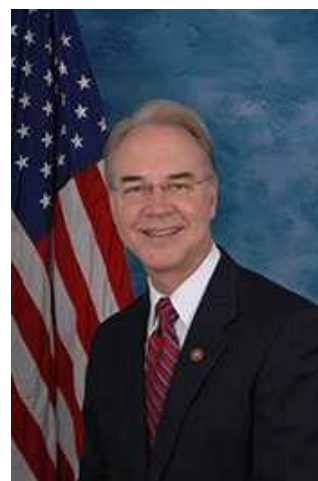
Secretary Tom Price

The Russell Library recently acquired two congressional collections. Tom Price served four terms in the Georgia State Senate before winning election from Georgia's 6th District in 2004. Price served as Chairman of the House Republican Policy Committee, Republican Study Committee, and Chairman of the powerful House Budget Com-