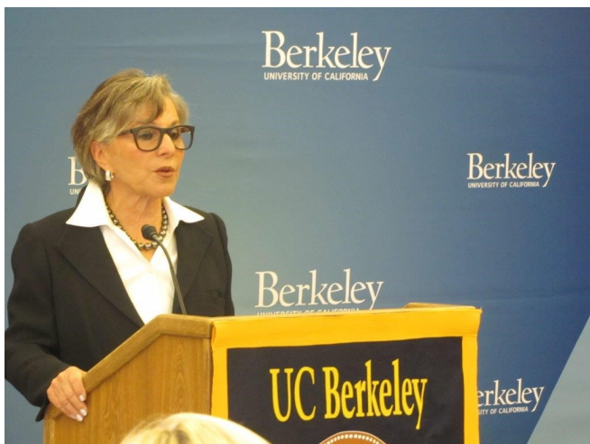
Retiring Senator Barbara Boxer (D-CA) during press conference announcing her decision to donate congressional papers to UC Berkeley.

Adapted from a post on The Byrd Center Blog .