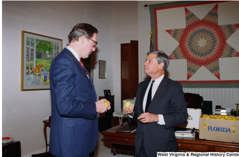
Senator Rockefeller and Senator Graham of Florida exchange West Virginia apples and Florida oranges following the WVU football team win over Miami in November 1993.