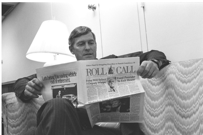
Senator Timothy Wirth reads an issue of Roll Call, July 18, 1991.