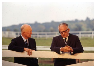
Goldwater and President Eisenhower at Gettysburg, September 21, 1964.

Each Thursday this fall Arizona State University posted rare candid color photographs from Senator Barry Goldwater's legendary 1964 campaign for President in its Facebook