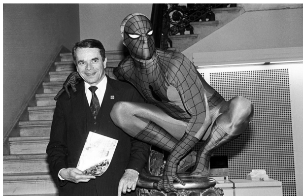
Spiderman perches on the staircase rail next to Representative Dale Kildee, February 20, 1992. (Roll Call 1992-106)

The Roll Call morgue consists of 10,381 contact sheets (approximately 280,000 images) arranged chronologically. Catalog records for each contact sheet will soon be searchable through the LC Prints and Photographs Online Catalog ( http://loc.gov/pictures ). The actual contact sheets are available for chronological browsing in the Prints and Photographs Reading Room. The negatives, used to fill photo orders, are stored in the Library's state-of-the-art cold storage facilities.