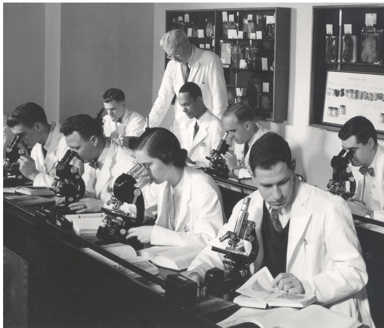
Student Classes. Faculty Teaching Lab, 1950s.