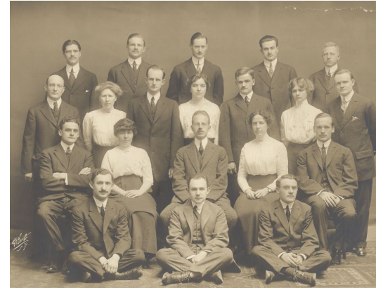
Cornell University Medical College Class of 1914.

Weill Cornell Medicine, 1898- Weill Cornell Medicine Qatar, 2001-