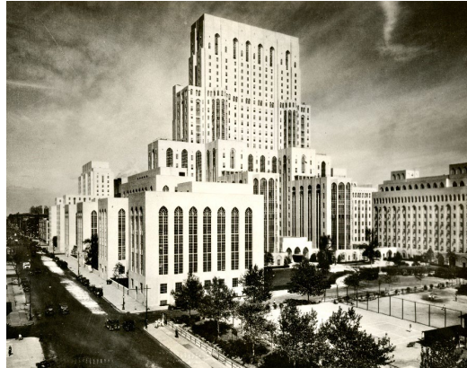
New York Hospital-Cornell Medical Center from York Avenue, 1930s.

NewYork-Presbyterian (formerly New York Hospital), 1771-