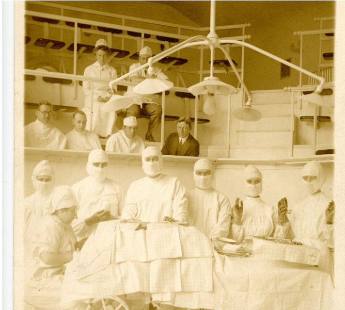
Operating Room Amphitheater, New York Hospital, circa 1915.