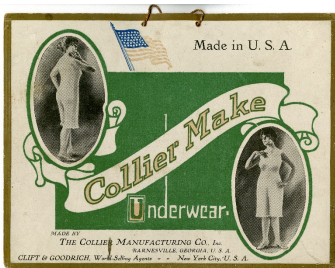
"Collier Made Underwear" advertisement card, undated