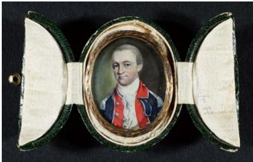
Portrait Miniature - Col. Benjamin Tallmadge (1754-1835)

The Institute of Museum and Library Services awarded a grant of $24,750 to the Litchfield Historical Society's Helga J. Ingraham Memorial Library for a one-year project, Improving Access: CollectionSpace and ArchivesSpace . The project team will create a user-friendly public interface that will provide patrons with a single search portal for the Society's instances of CollectionSpace and ArchivesSpace .