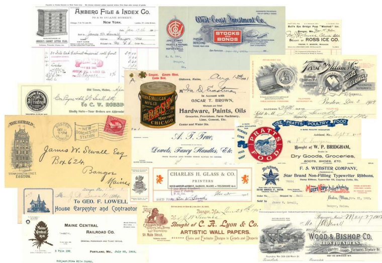
Collage of letterheads and billheads, 1900-1904, MSS 921.