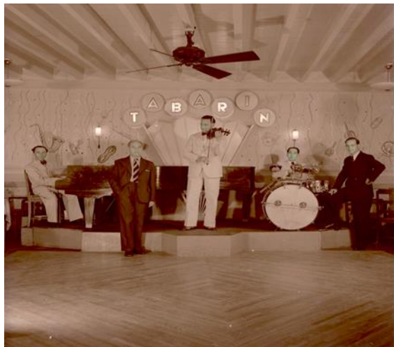
Tabarin Nightclub, ca. 1939