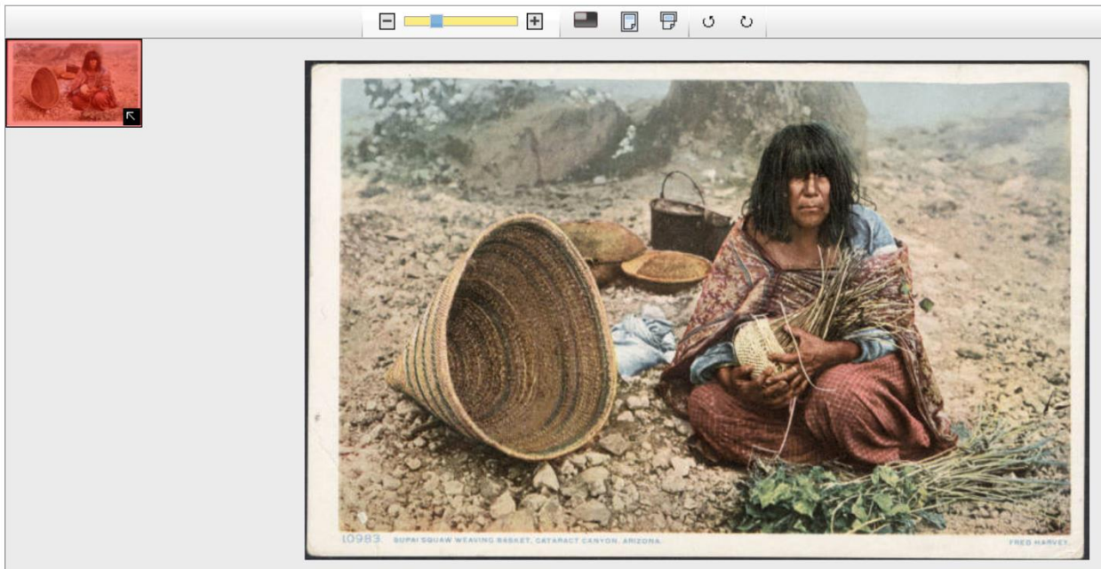
Figure 3. Derogatory Title Retained and Used for Caption.