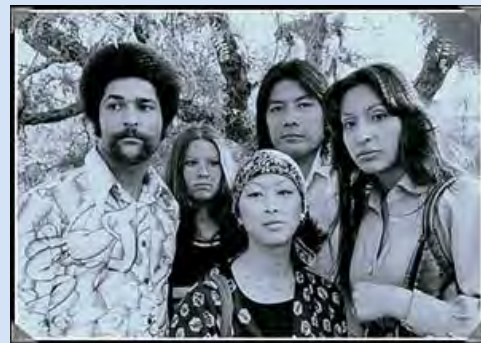
The Changing Face of California State University, circa 1970s. Public Affairs. Photo Collection. Courtesy of the California State University Archive.

The Archivists and Archives of Color Section (AAC) is an interest group within the Society of American Archivists. SAA is the oldest and largest archival association in North America, serving the educational and informational needs of more than 5,500 individuals and institutional members. The AAC Section helps to identify concerns and promote the needs of archivists and archives of color.