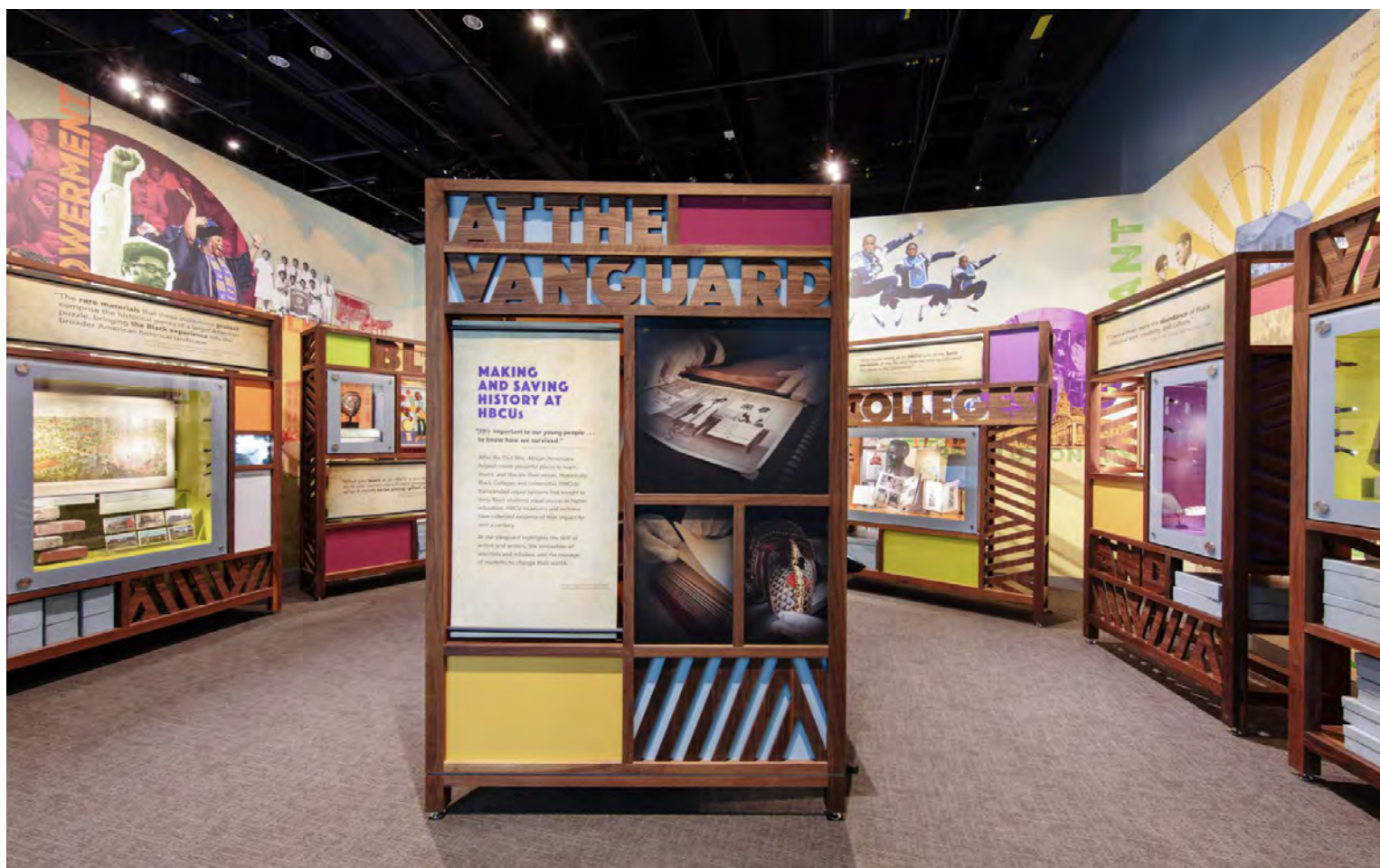
Photo of "At the Vanguard" exhibit.

EXHIBIT • January 16, 2026 – July 19, 2026