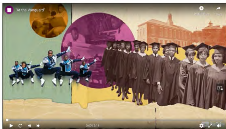
Screenshot of the "At the Vanguard" informational video trailer.

https://nmaahc.si.edu/explore/exhibitions/vanguard