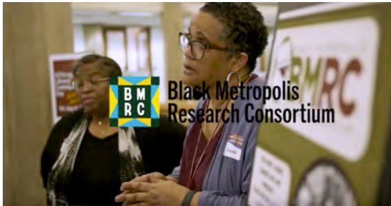
Video screenshot of 2 people presenting.

What does the BMRC do? We made a film to answer that question. Learn about our nearly 20 year history, the 26 archives, libraries and museums that are our members, our fellowship and internship programs and our commitment to the archives of Black Chicago. Hear from archivists at our member institutions and others who have benefited from our work connecting and valorizing archives of Black Chicago history.