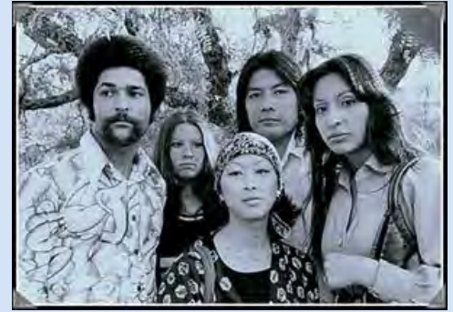
The Changing Face of California State University, circa 1970s. Public Affairs. Photo Collection.

The Archivists and Archives of Color Section (AAC) is an interest group within the Society of American Archivists. SAA is the oldest and largest archival association in North America, serving the educational and informational needs of more than 5,500 individuals and institutional members. The AAC Section helps to identify concerns and promote the needs of archivists and archives of color.