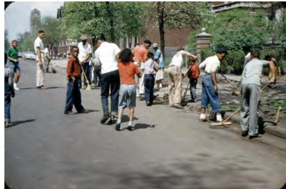
Adults and children in Chicago's Hyde Park-Kenwood neighborhood.

We are collectively witnessing the power of documentary evidence as individuals and communities are using mobile devices to record, capture, and share their experiences during this current moment in lived history. In response, national and local organizations are actively soliciting materials related to both the COVID-19 pandemic and the protests in response to police brutality. While we do not endorse any specific archives or cultural heritage organizations, we offer 5 quick tips if you're considering donating your collection to an archive, museum, or other cultural heritage organization