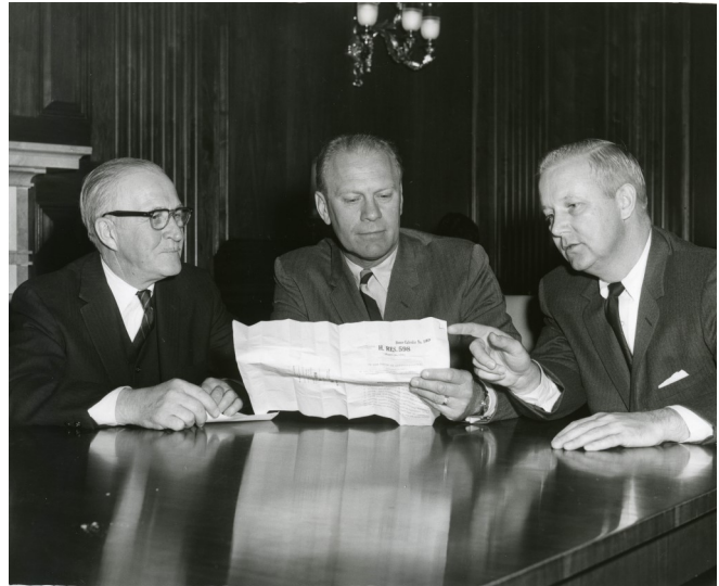
Congressmen Arch Moore (right), Gerald Ford (center), and William McCulloch reviewing a House Resolution, circa 1965

Moore's congressional archives include more than 200 boxes of speeches, legislative materials, campaign and Republican Party files, West Virginia public works project documentation, correspondence with constituents, and more. The archives document his service on numerous committees and subcommittees, including Judiciary and Select Small Business. Throughout his tenure, Moore supported civil rights and public