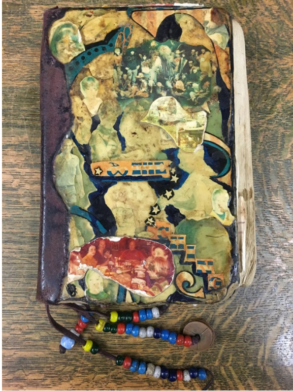
The I Ching, Family papers and artifacts, circa 1950s-2000, Ken Kesey Papers, Ax 279, Box 31, Folder 2, Special Collections and University Archives, University of Oregon Libraries, Eugene, Oregon

Also included among noted artifacts in the Personal papers and memorabilia series, is Ken Kesey's personal, annotated copy of The I Ching . Some student material from Ken Kesey's period at the University of Oregon is also included in this series.