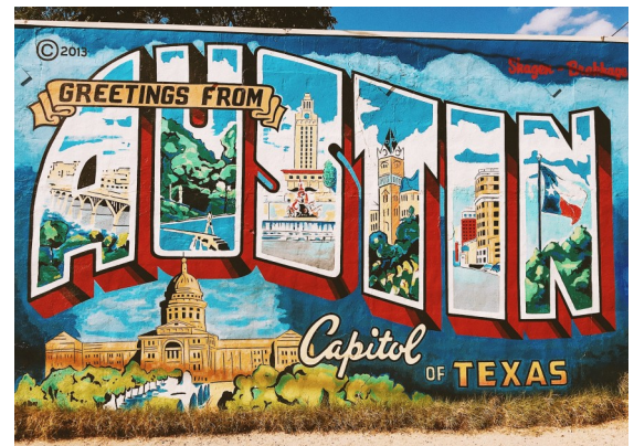
Austin, TX Postcard Mural.