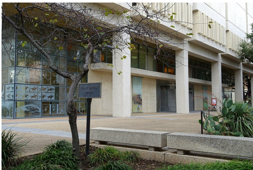
Harry Ransom Center, University of Texas at Austin.