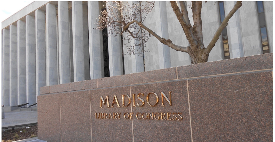
View of Library of Congress Madison Building

Afternoon break-out sessions included leveraging local history, coping with archival silences, TPS beyond the Humanities, and more . A special post-unconference zine summarizing lessons learned can be viewed on the Teach with Stuff main website.