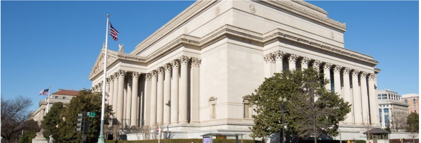
NARA Headquarters