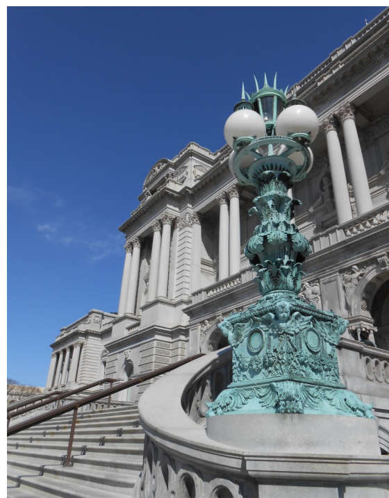
View of Library of Congress Jefferson Building lamp

If you would like additional information about these leadership roles or the election process, please contact the 2019 RAO Nominating Committee. We will be happy to answer any questions that you may have.