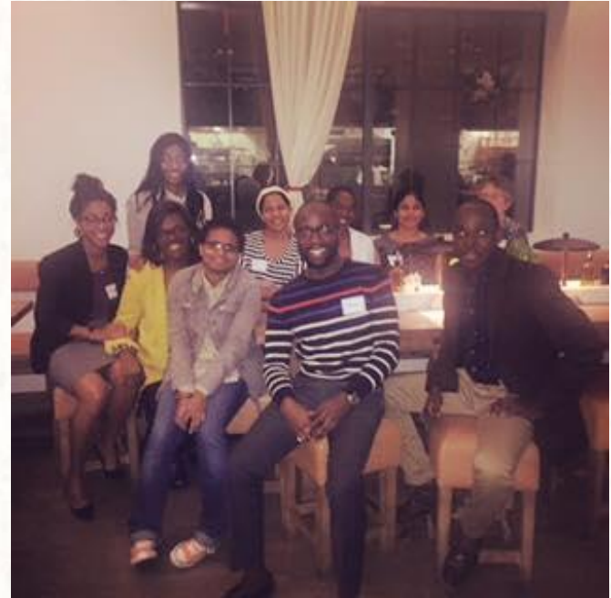
New Orleans and Washington D.C., 2013