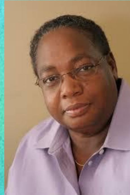
Brenda S. Banks Travel Award, established 2017