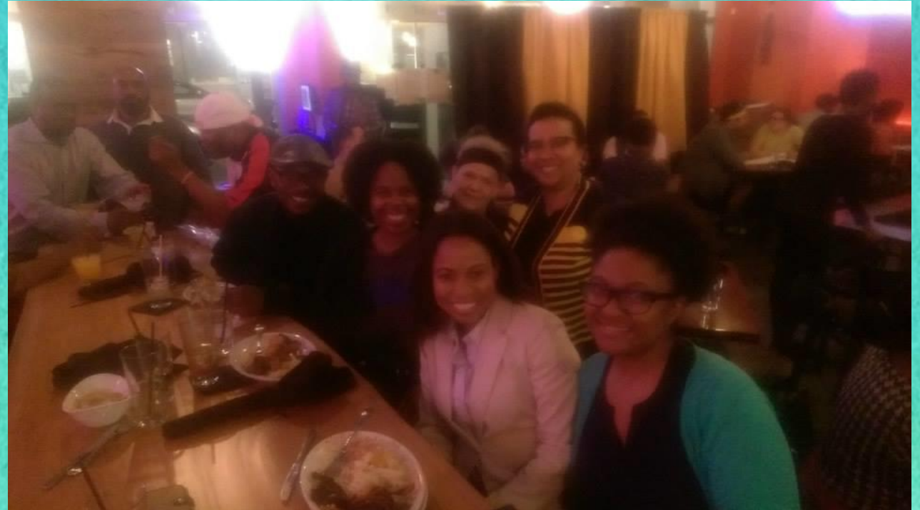
AAC Meetups – Los Angeles, 2015 and Chicago, 2013