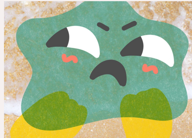
1 Affect & Relations

what discussed areas resonate most with your archival work or research?