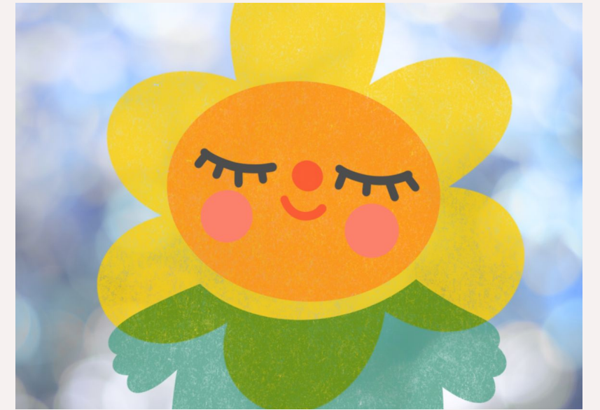
2 Affect & Spaces/Places