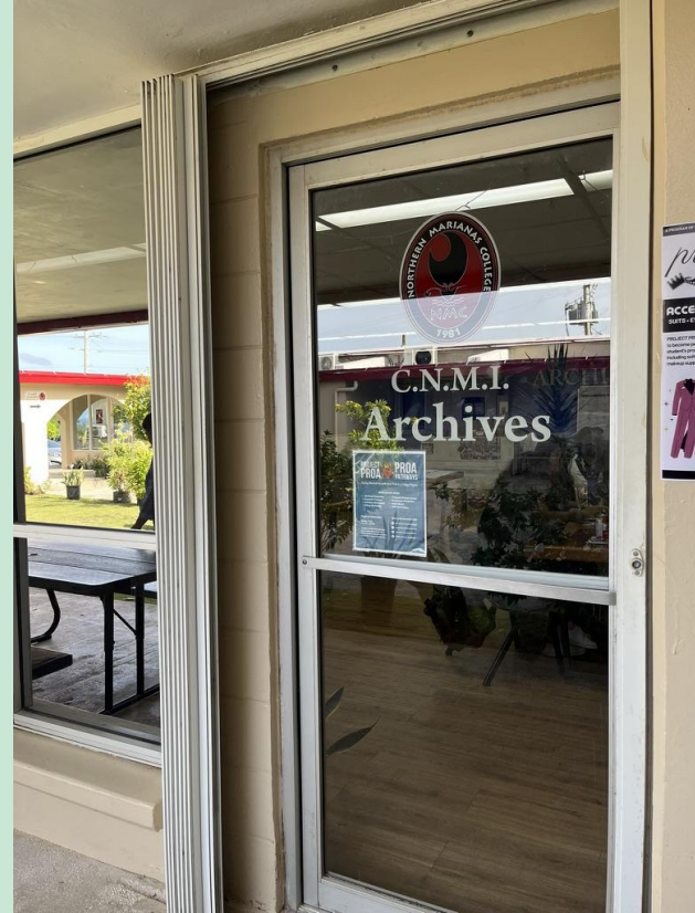
CNMI Archives at Northern Marianas College