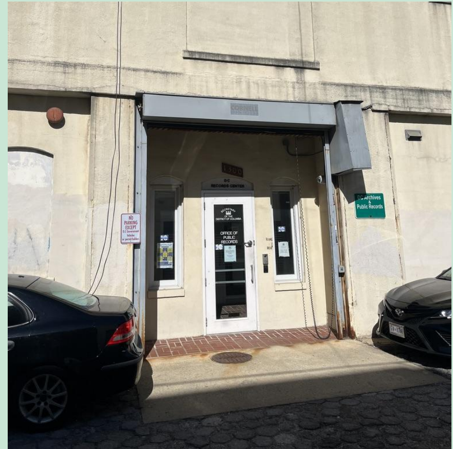
Washington, DC Office of Public Records and Archives