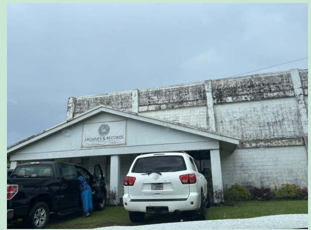
American Samoa Office of Archives and Records Management