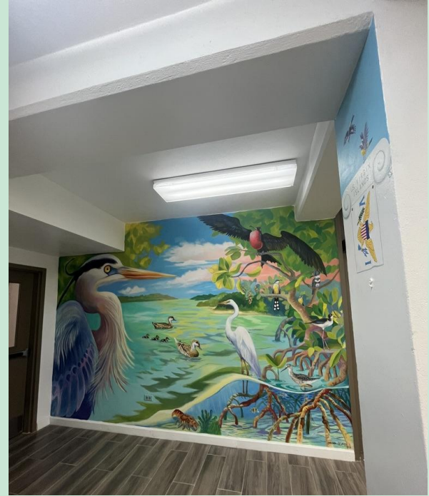
US Virgin Islands Division of Libraries, Archives, and Museums (Florence Williams Library)