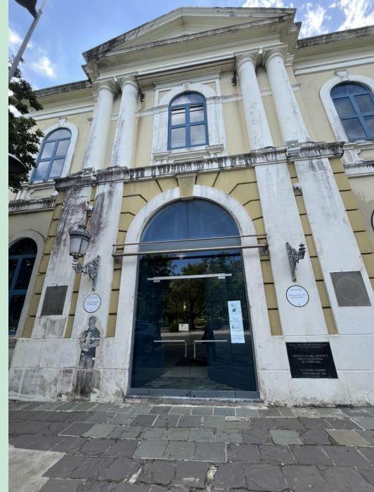
Archivo General de Puerto Rico

The work of the consultants is not to dictate external solutions but rather to listen to the project partners and articulate their needs and ideas to create a roadmap for implementation.