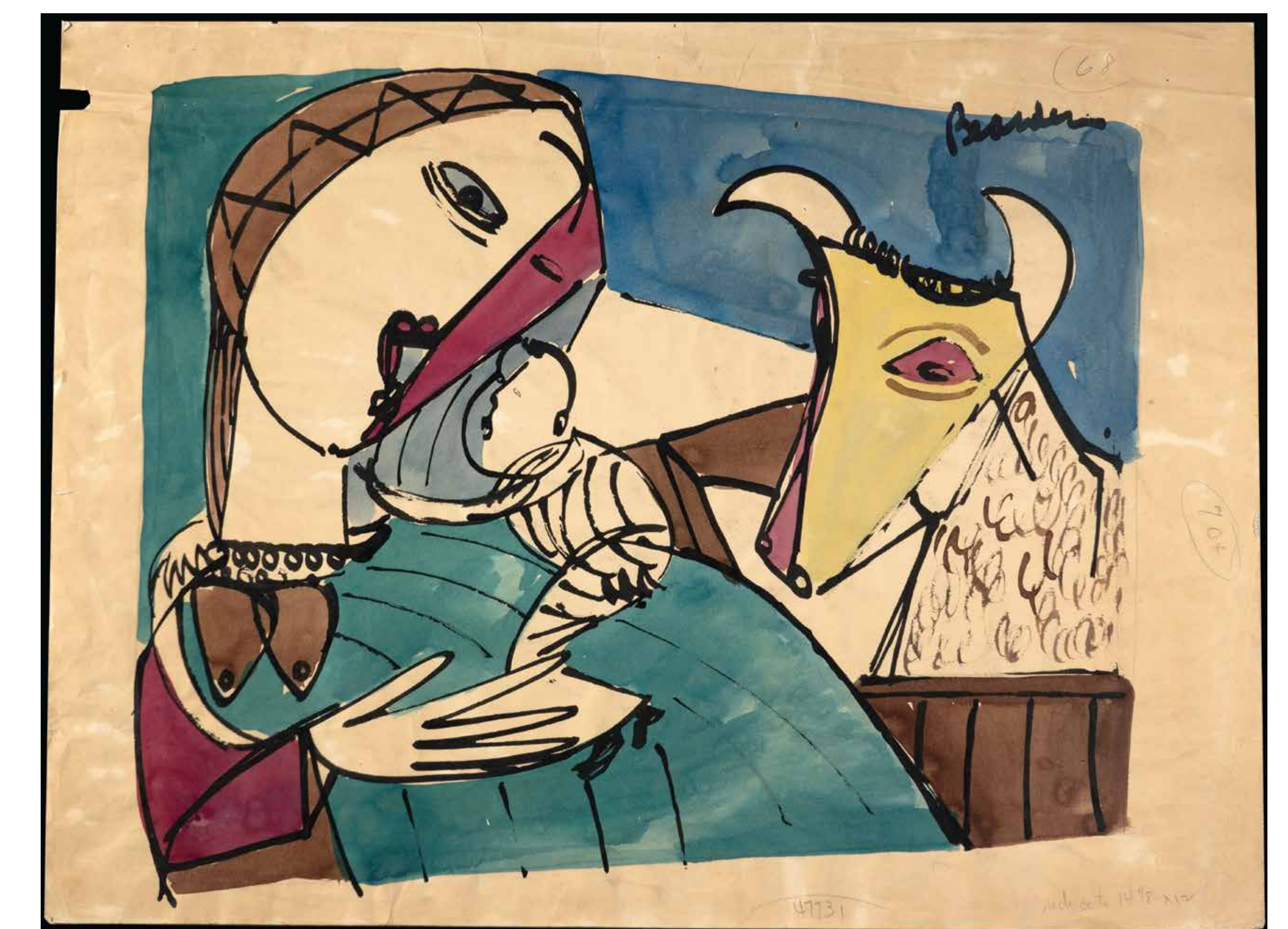
Painting by Romare Bearden: Mother, Baby, Ox