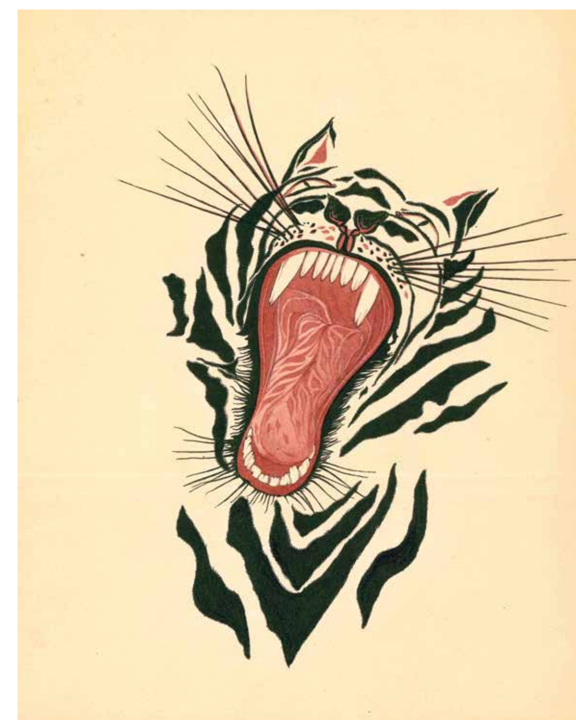
Ink and watercolor illustration by Alastair