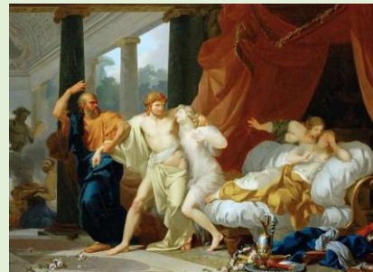
↑ Louver Museum