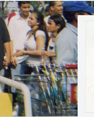
Marcha de Jovenes en Homestead Abril 7, 2006 © 1981-2002 Eastman Kodak Company KODAK SAFETY FILM Kodak