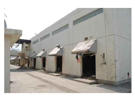
The Disaster Prevention Building containing the storage rooms (Taken on June 1, 2011).

345.6 m x 5 shelves x 80% (presumed occupancy rate) = 1382.4 m