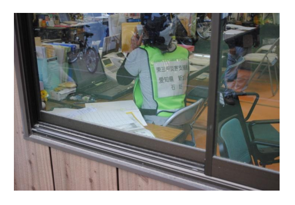
The prefabricated town hall building sent as emergency relief by Japan's Ministry of Land, Infrastructure, Transport and Tourism.

Employees from Shinshiro, Aichi helping out.