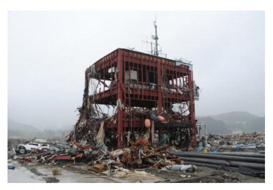
Over half of the town hall employees in charge of carrying out the Disaster Prevention Action Plans who evacuated to the roof died.

The tsunami-ravaged Disaster Prevention Office building (Taken on June 2, 2011).