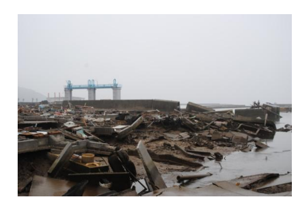
A seawall and floodgate near Shizugawa Port (Taken on June 2, 2011).

All that is left of the town hall building is the concrete foundation in the foreground. See the Minamisanriku Town Hall website for photos from when the tsunami struck.