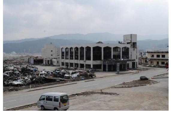
The Rikuzentakata Civic Cultural Centre where the tsunami went over the roof.