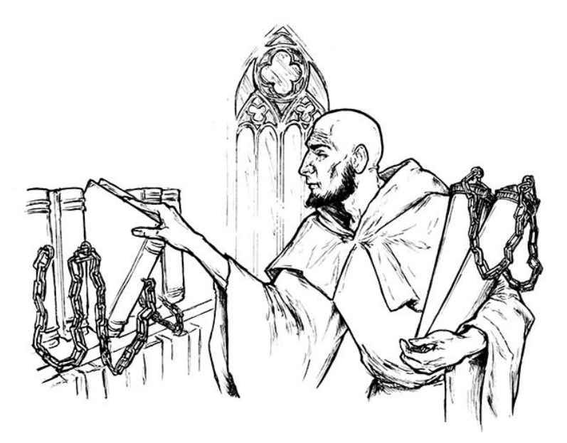
Linked Data