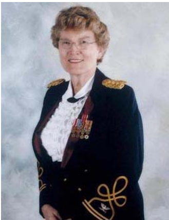
Retired Army Reserve Col. Margarethe Cammermeyer

In the scope of the near-daily developments regarding the future of the military's "Don't Ask, Don't Tell" policy, this week – following the congressional votes on May 27 – was not expected to draw more headlines.