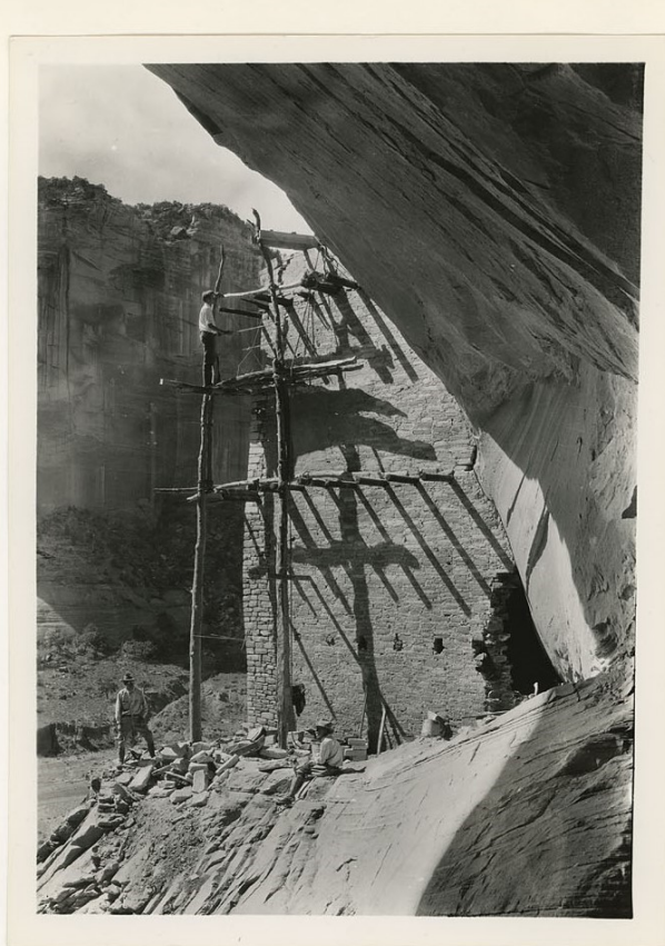
Mummy Cone Tower Repair 1932

which mirrors that of museum collections, it is possible to provide intuitive access and highlight relationships between the two.