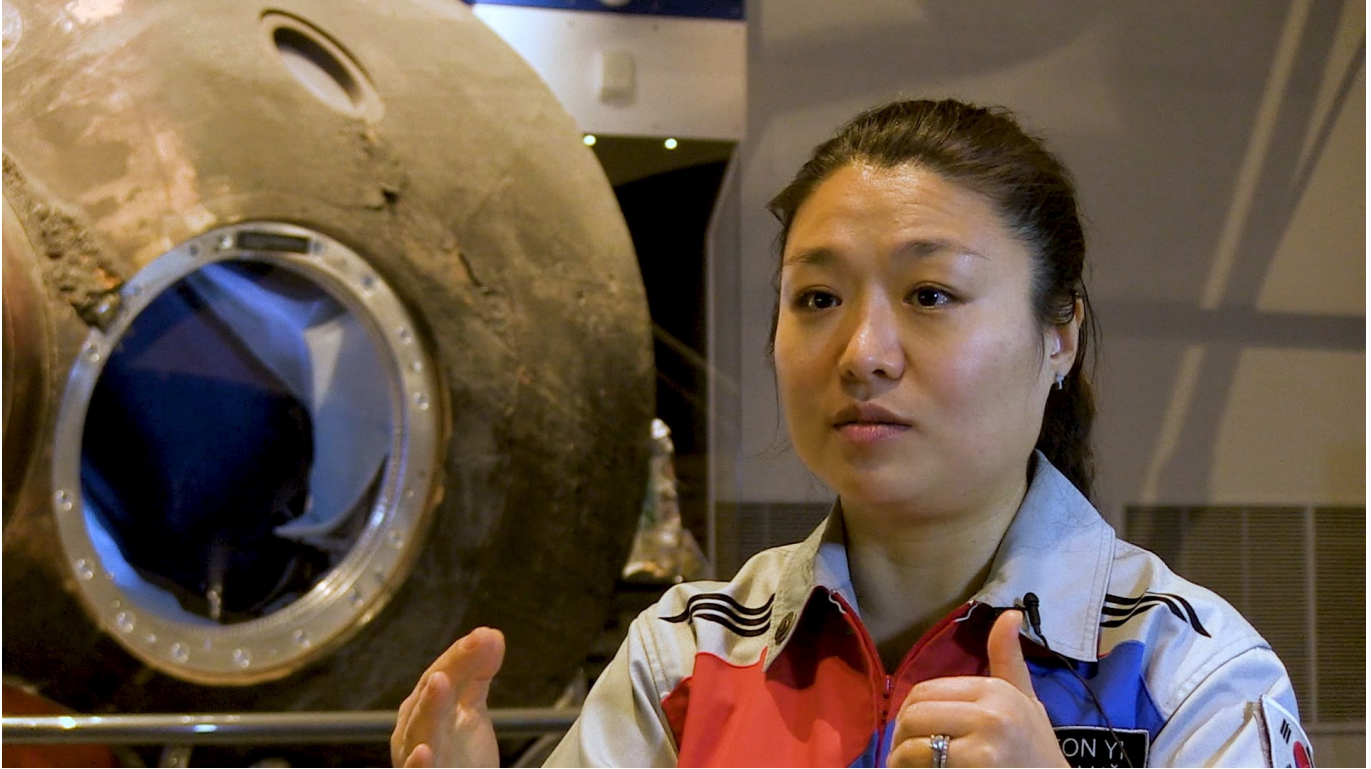
Astronaut Soyeon Yi