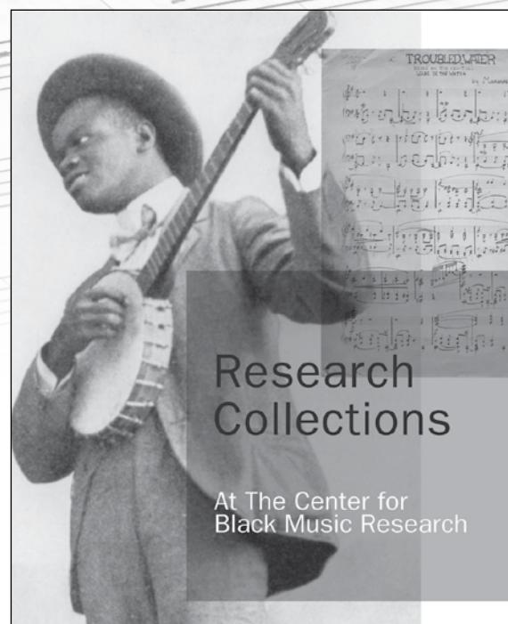
Above: Brochure about the CBMR archival collections.

In addition to offering standard library procedures—reference, instruction, and outreach—the repository provides funding for scholars to do research. Due to the specialty of the collection, materials are non-circulating. Having worked as an intern at CBMR before attending graduate school, I can attest to the vast holdings and amazing services the library and archives provides.