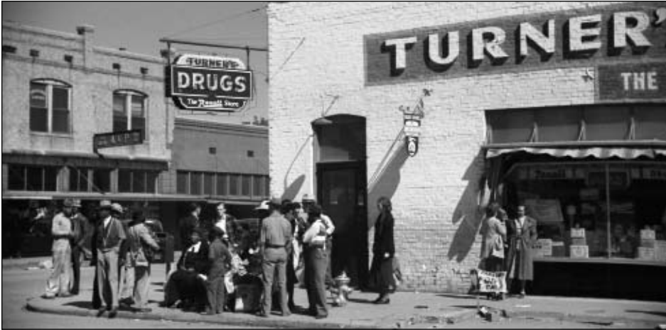
FIGURE 7. Main Street on Saturday afternoon, Belzoni, Mississippi, 1939. Black and white nitrate negative, 35 mm, Digital file from original negative, available at http://hdl.loc.gov/loc.pnp/fsa.8a41181.

So I got a 1930s atlas and I highlighted every place that he went. This is a map of Iowa. He went from there, there, there, there, then he went back to here then he went back to Illinois. I don't think you could get more contextualization than what I've done. (P5, 21)