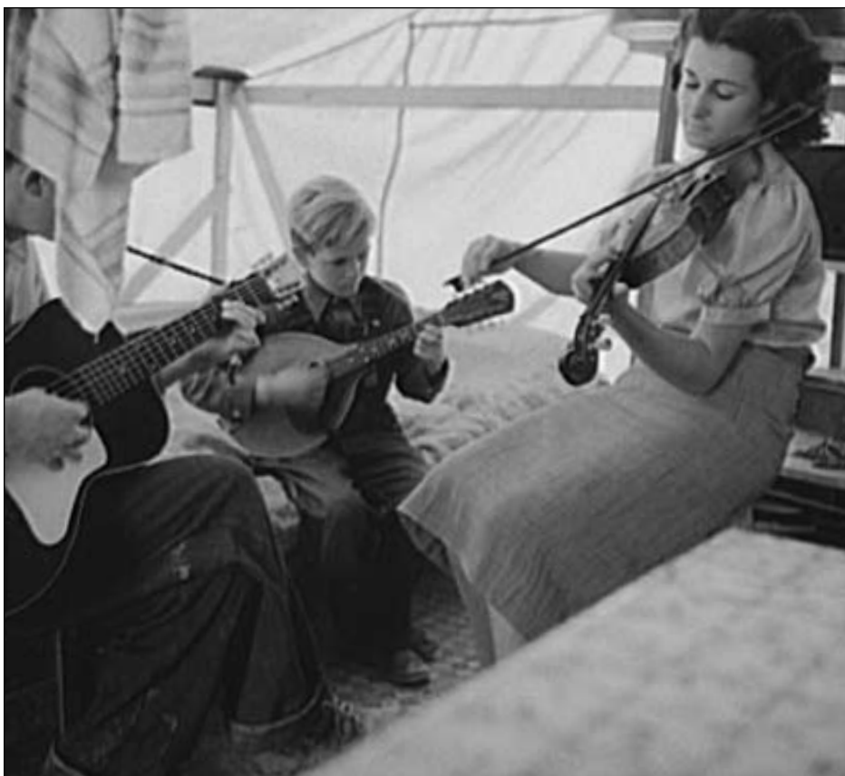
FIGURE 8. Migrant Family from Arkansas playing hill-billy songs, Calipatria, California, 1939. Dorothea Lange, 1895–1965, photographer. Black and white nitrate negative, Farm Security Administration--Office of War Information Photograph Collection, Library of Congress Prints and Photographs Division. Digital file from intermediary roll film, available at http://hdl.loc.gov/loc.pnp/fsa.8b33352 .