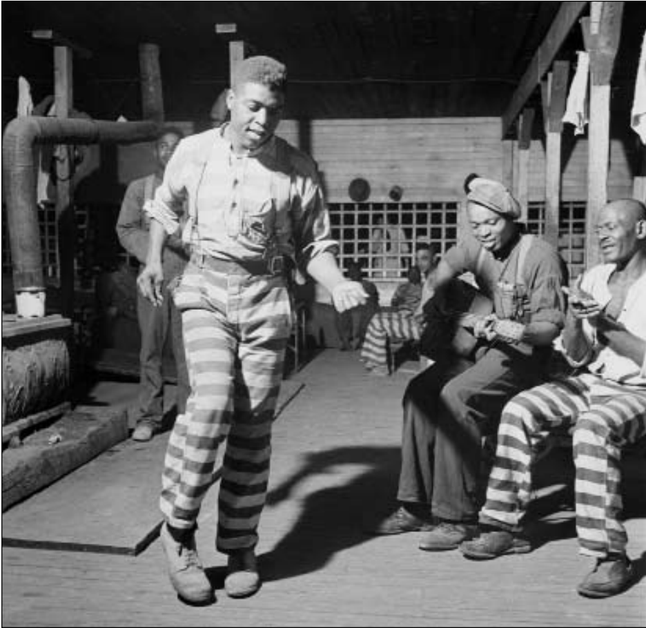
FIGURE 6. In the convict camp in Greene County, Georgia, 1941. Jack Delano, 1914–1997, photographer. Nitrate negative, Farm Security Administration—Office of War Information Photograph Collection, Library of Congress Prints and Photographs Division. Digital file from original negative, available at http://hdl.loc.gov/loc.pnp/fsa.8c29075 .

Her contextualization of the archival record over space and time turns on the type of detective work that is a common feature of contemporary rephotography, which is the practice photographing the same scene at two points in time, popularly referred to as “then and now” photography. Participant 2 asserted that rephotography was a factor in the expression of colonial power by the Russian occupiers. In the interview, Participant 2 showed two digital images of photographs taken roughly eight or nine years apart (ca. 1864 to 1872) and published in two separate photographic albums: