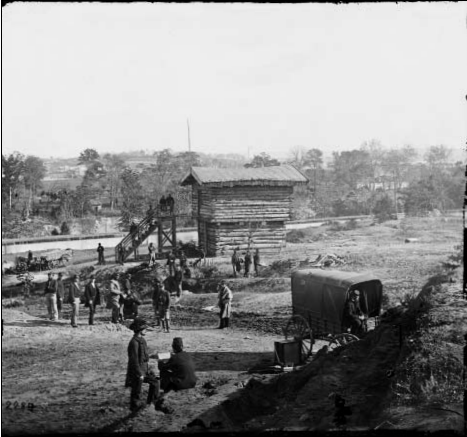
FIGURE 1. Arlington Heights, Virginia. Blockhouse near Aqueduct Bridge, 1861–65. Wet collodion glass stereograph negative, LC-B811-2282, Selected Civil War Photographs, Library of Congress Prints and Photographs Division. Digital file from original negative, available at http://hdl.loc.gov/loc.pnp/cwpb.01439 .