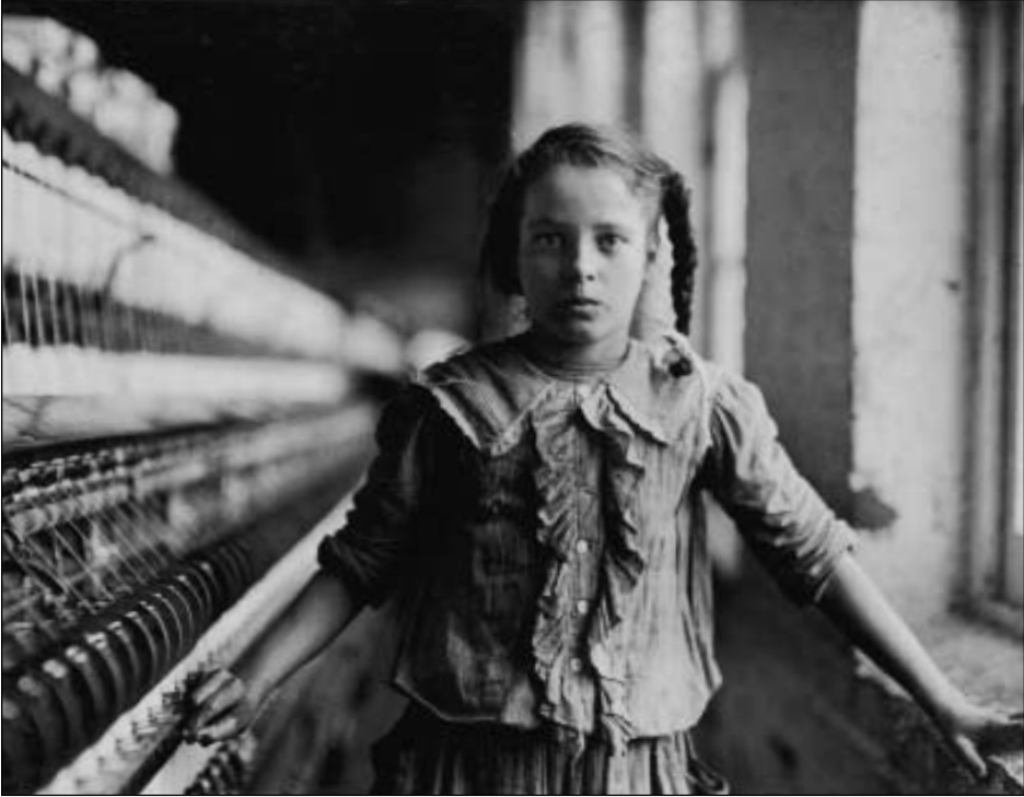
FIGURE 4. One of the spinners in Whitnel Cotton Mfg. Co. N.C., 1908. Lewis Wickes Hine, 1874–1940. Photographic print from the records of the National Child Labor Committee, Library of Congress Prints and Photographs Division. Color digital file from black and white original print, available at http://hdl.loc.gov/loc.pnp/nclc.01555 .

photograph is there. Because there are a lot of things in that photograph that might be very important” (P3, 39).